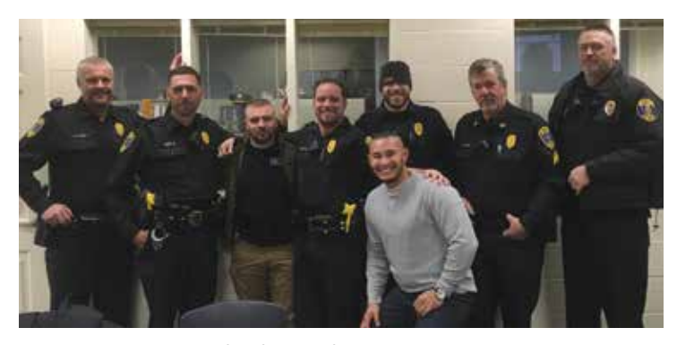
The Clinton Police Department.

We also need to thank the many community groups who have helped us raise funds during the year. The Clinton Lions Club holds held its annual Pancake Breakfast for us on the last