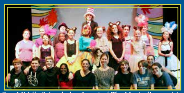
Our Middle School play Seussical The Musical! was a hit.